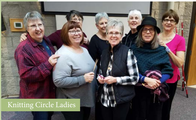
Knitting Circle Ladies

The Caring Closet ministry frequently operates in conjunction with the Be Our Guest event. Hygiene products such as shampoo, toothpaste, soap or deodorant are distributed each month to those who attend. Additionally, a bag with laundry detergent, dish soap and toilet paper is also handed out.