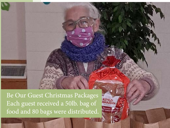
Be Our Guest Christmas Packages Each guest received a 50lb. bag of food and 80 bags were distributed.

At Holy Nativity, we care for each other in a myriad of ways. A Pastoral Care Team (Caring Connection), started in early 2023. This dedicated team makes visitations to those in the hospital, nursing homes, or individuals who are homebound. They also assure we maintain open communications through check-in phone calls. Additionally, Thinking of You, Get Well or Loving Support postcards are sent out by this team to assure that parishioners stay connected and cared for.