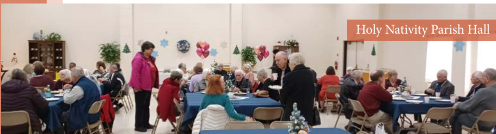
Holy Nativity Parish Hall