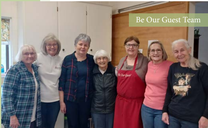
Be Our Guest Team

Outreach ministries are very important to the members of Holy Nativity. In many ways, we strive to be the hands and feet of Jesus in Meridian.