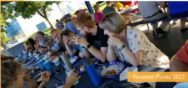
Summer Picnic 2022

The Ladies Group meets on a monthly basis to enjoy a seasonal outing events.