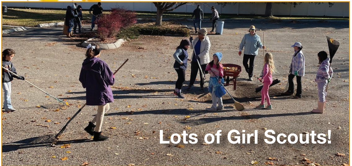
Lots of Girl Scouts!